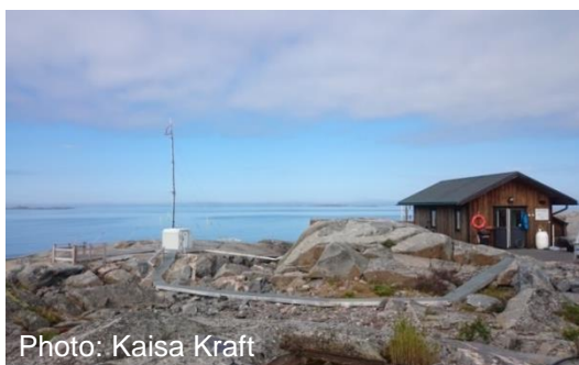
Fig. 2. SYKE's Imaging FlowCytoBot (IFCB) is situated in the Utö Atmospheric and Marine Research Station of the Finnish Meteorological Institute (left). Utö is located at the outermost edge of the Archipelago Sea, facing the Baltic proper (right).